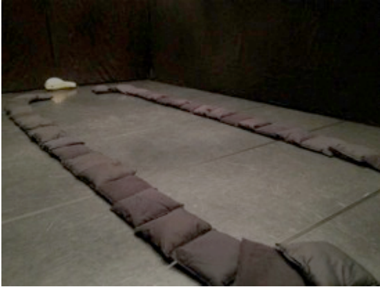
floor and seating arrangement

After agreement with the specifics of the set-up outlined by the company, stage set and floor have to be ready at the arrival of the company.