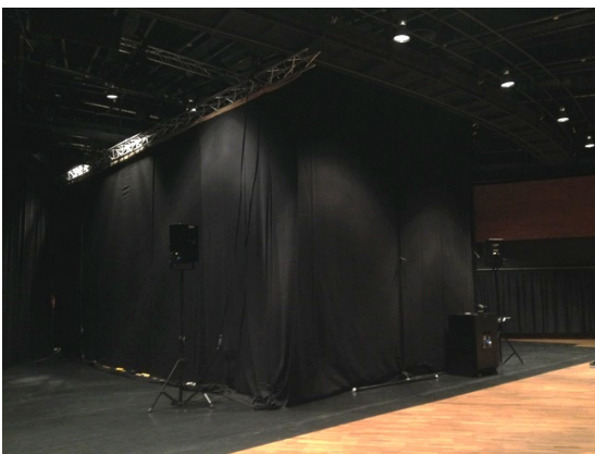
outside view with speakers and subwoofer