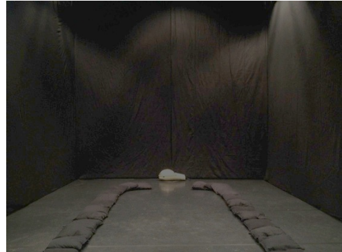
blackbox side 2

Alfredo Zinola Wichheimerstr. 36, 51067 Köln almamoretta@yahoo.it/+4915202755844