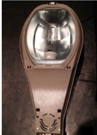
street light 2