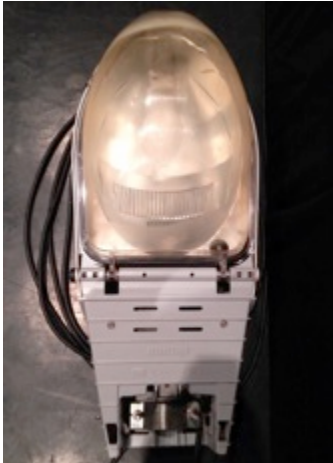
street light 1

We'll bring 2x Sodium Street light and 1 x hanging light (300 W).