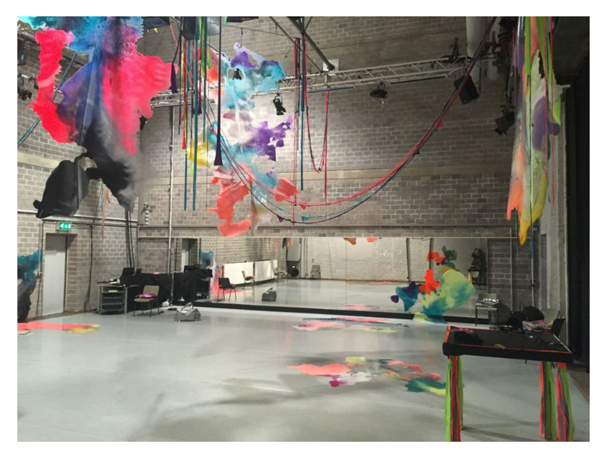
2 von 6